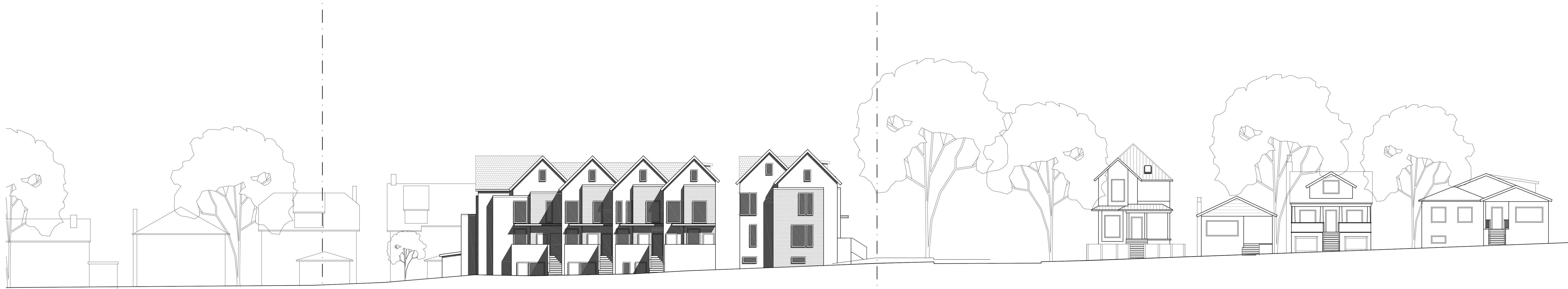
1 WEST 12TH STREETSCAPE (SOUTH ELEVATION) A210 1/16" = 1'-0"