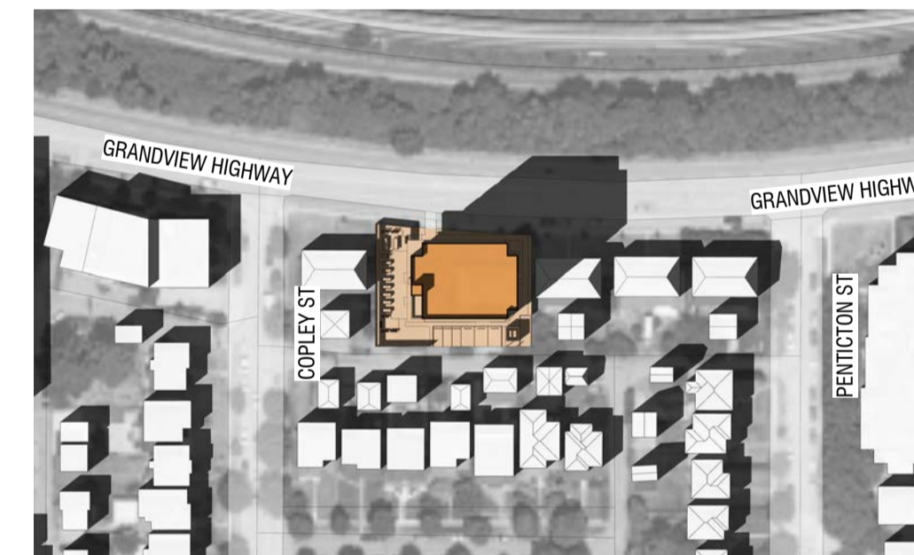
September 21st | 4:00pm