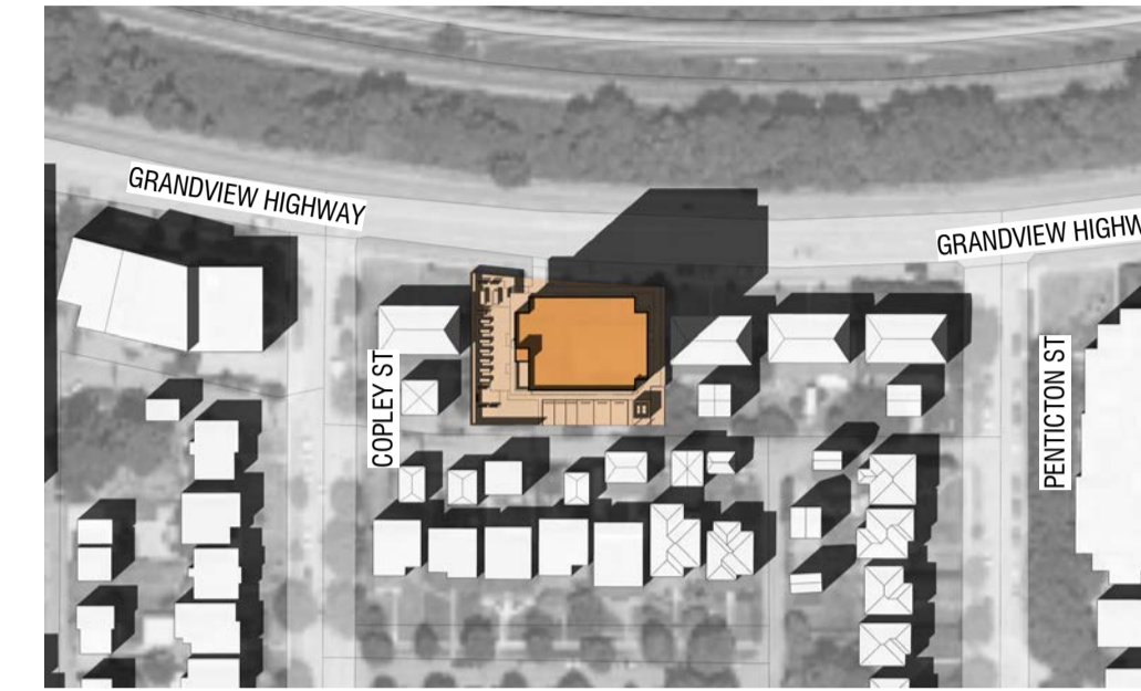
March 21st | 4:00pm