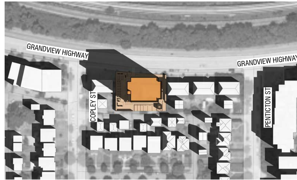
March 21st | 10:00am