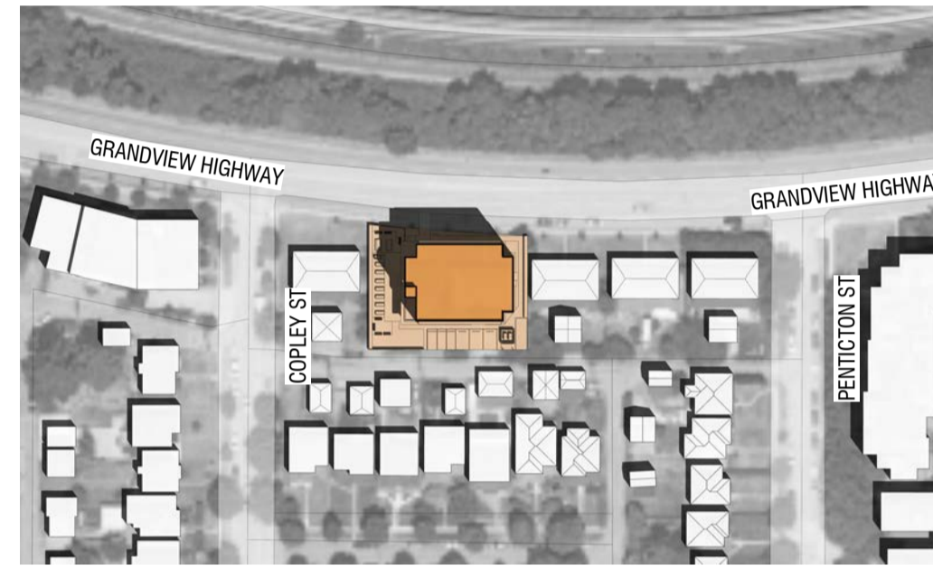
June 21st | 12:00pm