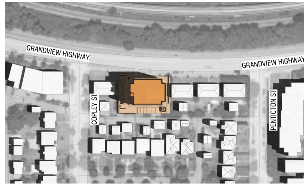
June 21st | 10:00am