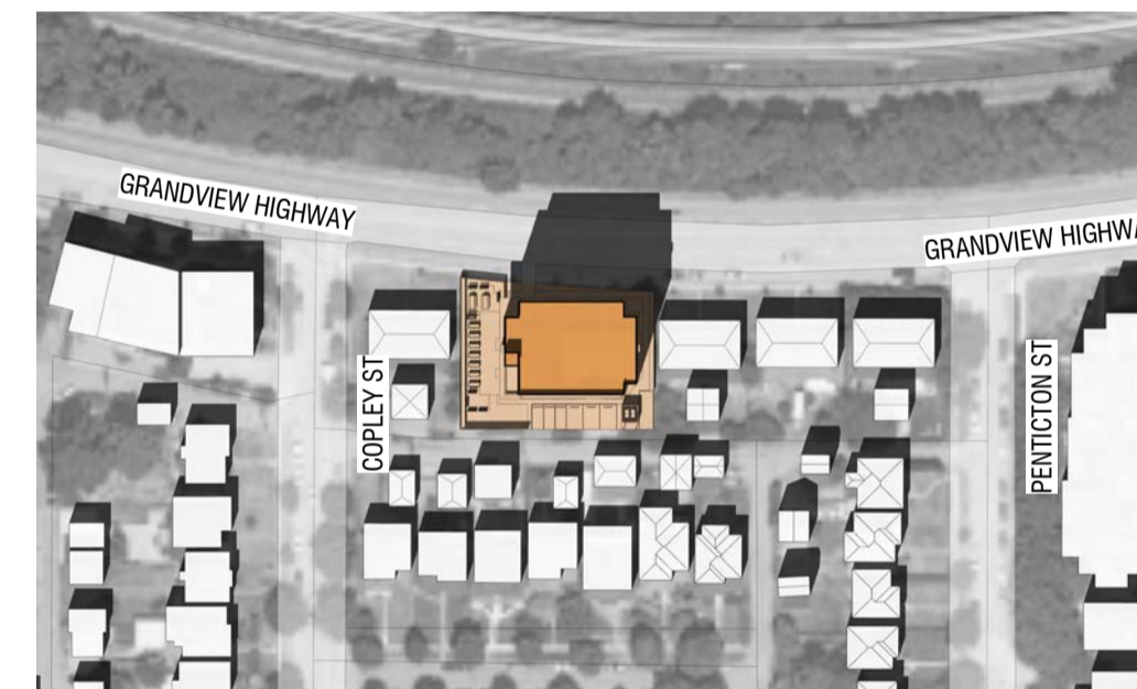
September 21st | 2:00pm