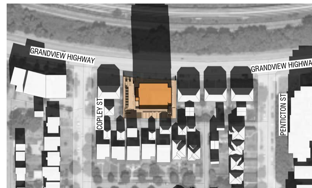
December 21st | 12:00pm