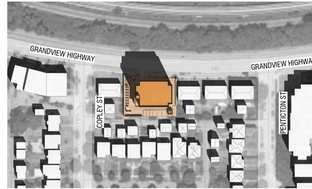
March 21st | 12:00pm