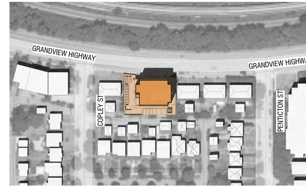
June 21st | 2:00pm