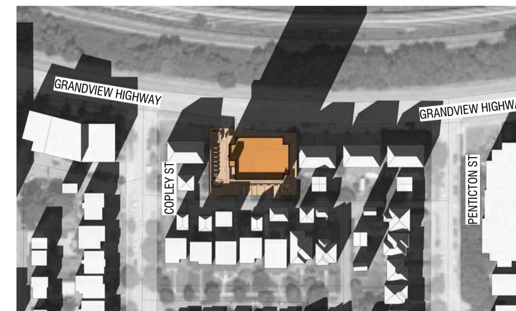
December 21st | 2:00pm