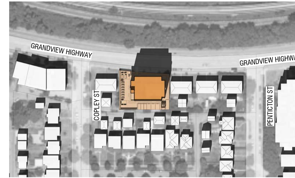
March 21st | 2:00pm