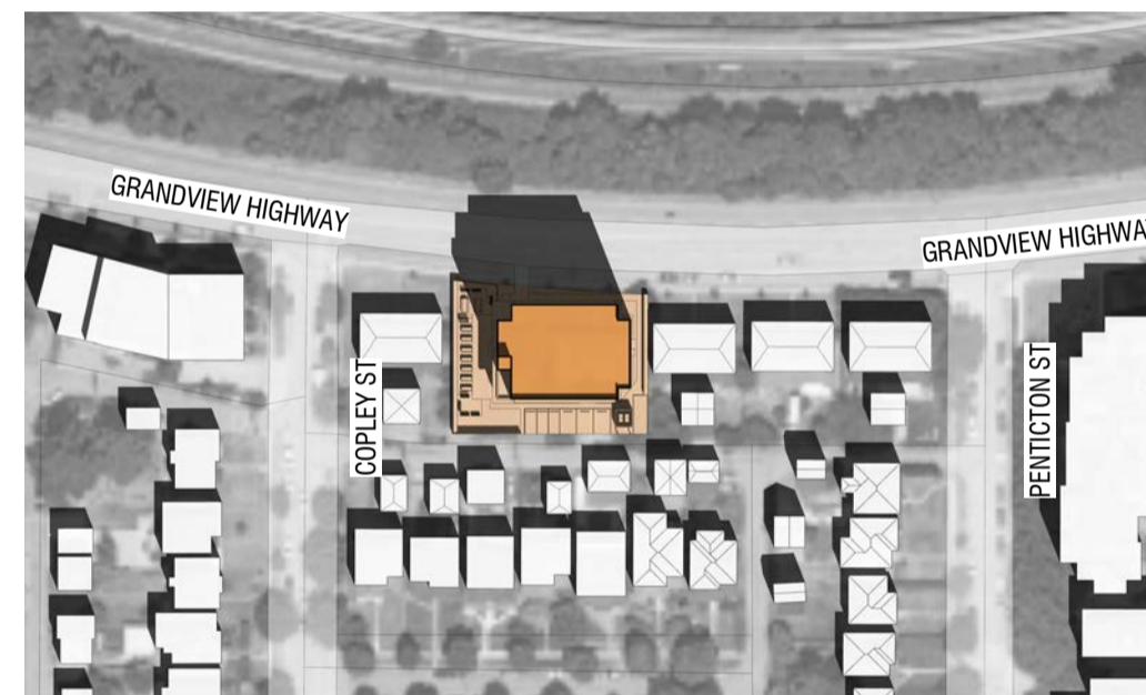
September 21st | 12:00pm