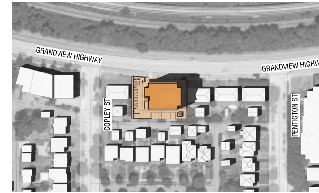
June 21st | 4:00pm