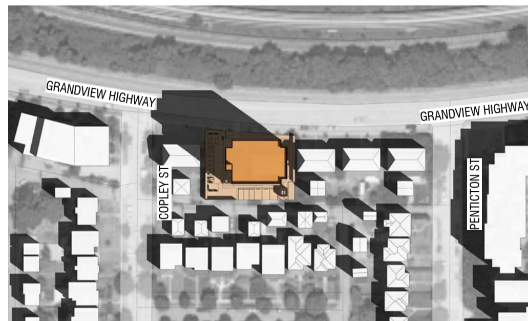
September 21st | 10:00am