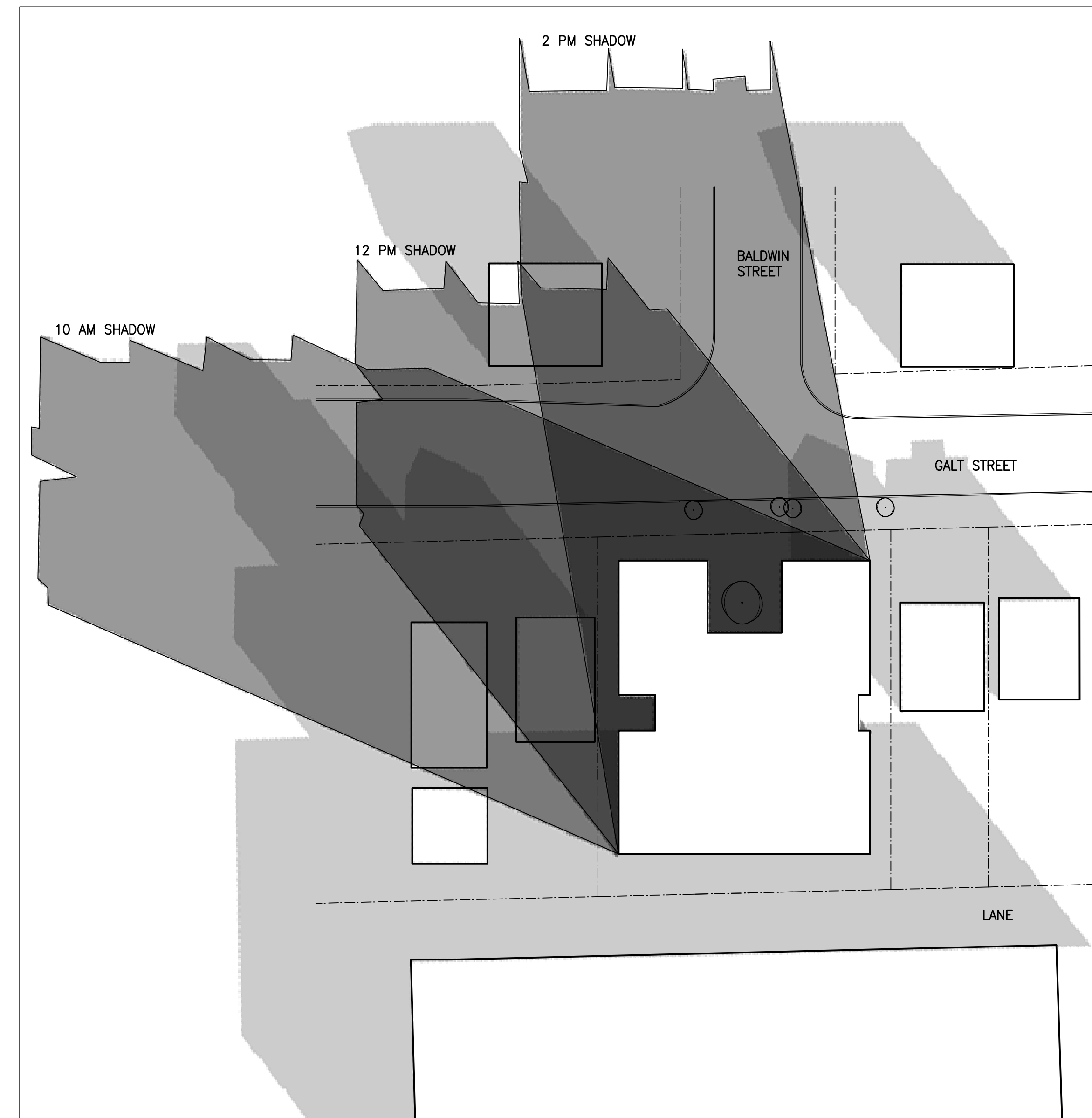
3 SHADOW ANALYSIS- WINTER SOLSTICE Scale 1/32" = 1'0"