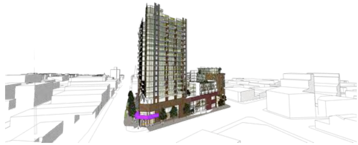
12 Kingsway and Tenth Avenue