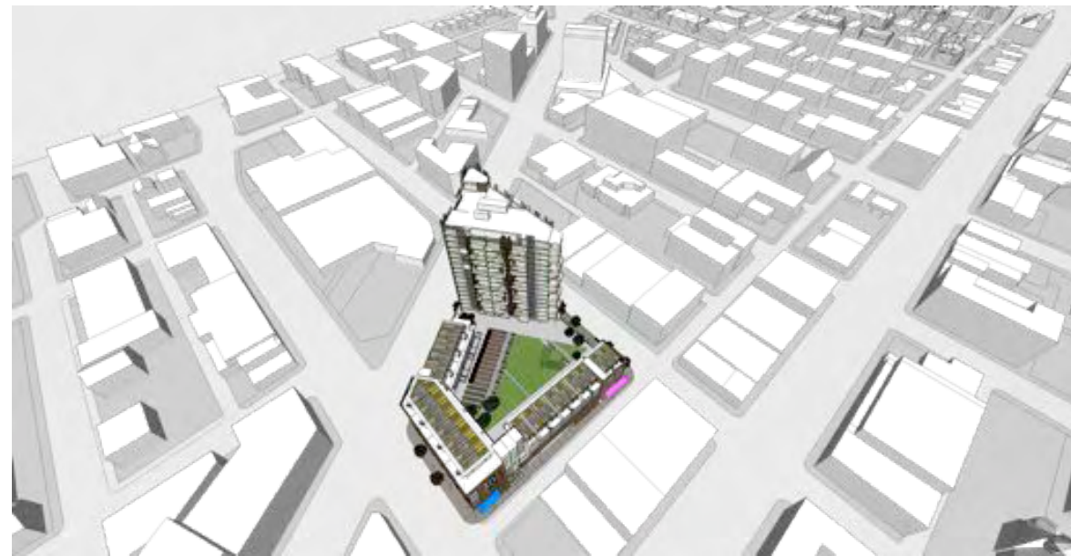
10 Kingsway and Broadway