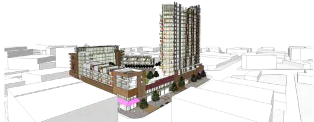
13 Watson Street and Tenth Avenue