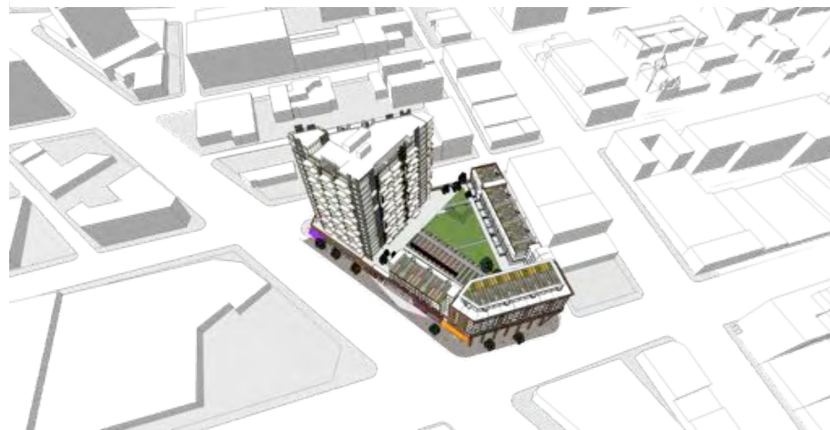
11 Kingsway, Broadway and Main Street