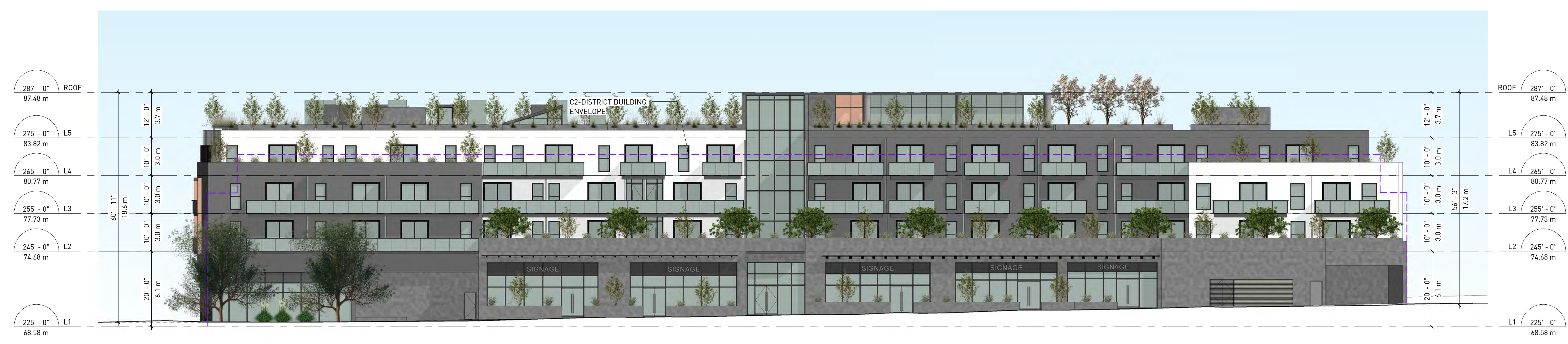
2 NORTH ELEVATION 1 : 175