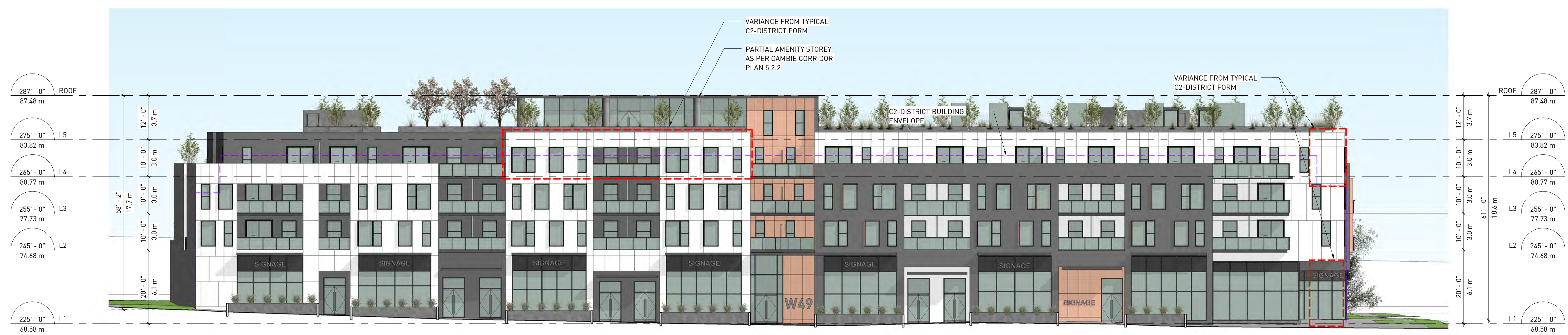
1 SOUTH ELEVATION 1 : 175