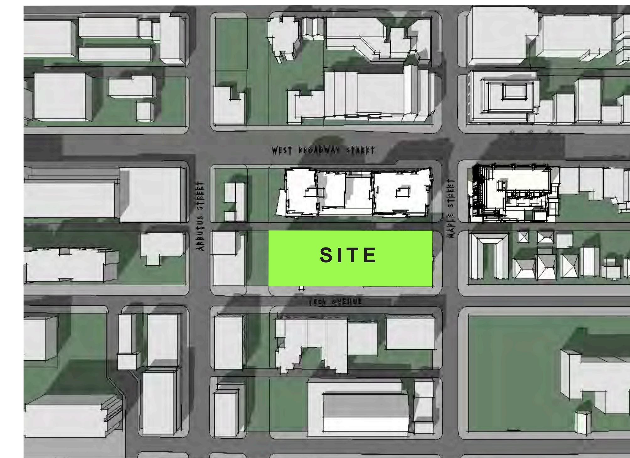
Massing Model Plan