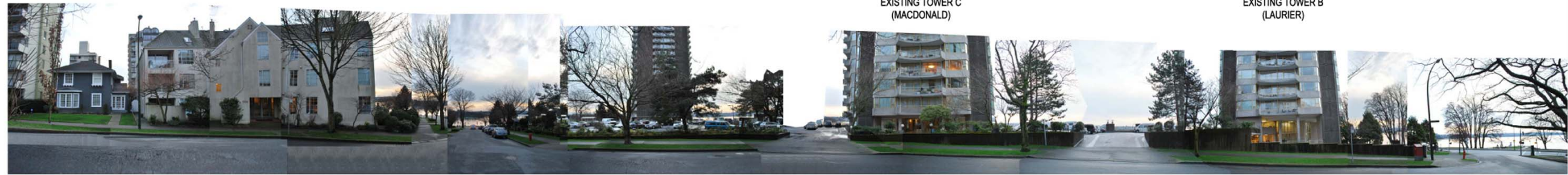
STREETScape @HARWOOD STREET--FACING WEST