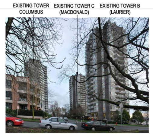
STREETScape @BEACH AVENUE+ BIDWELL STREET