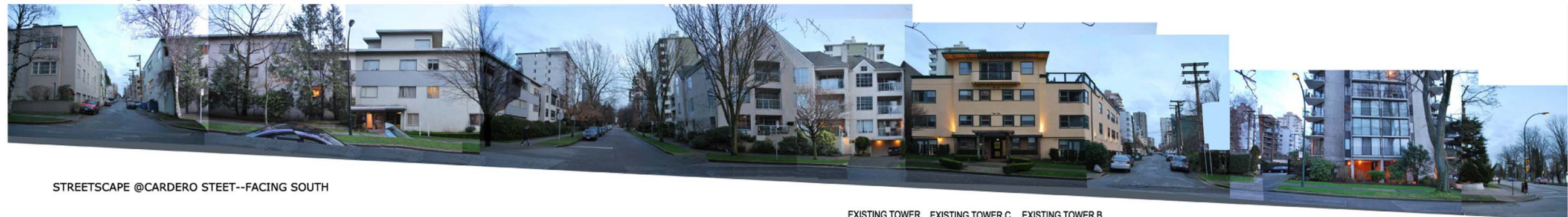
STREETScape @CARDERO STREET--FACING SOUTH