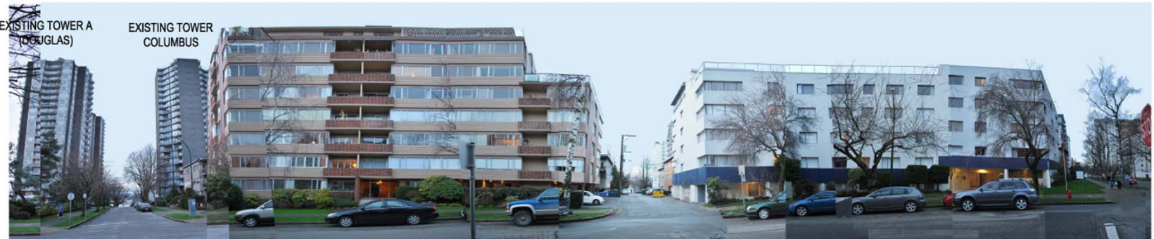
STREETScape @CARDERO STREET--FACING NORTH