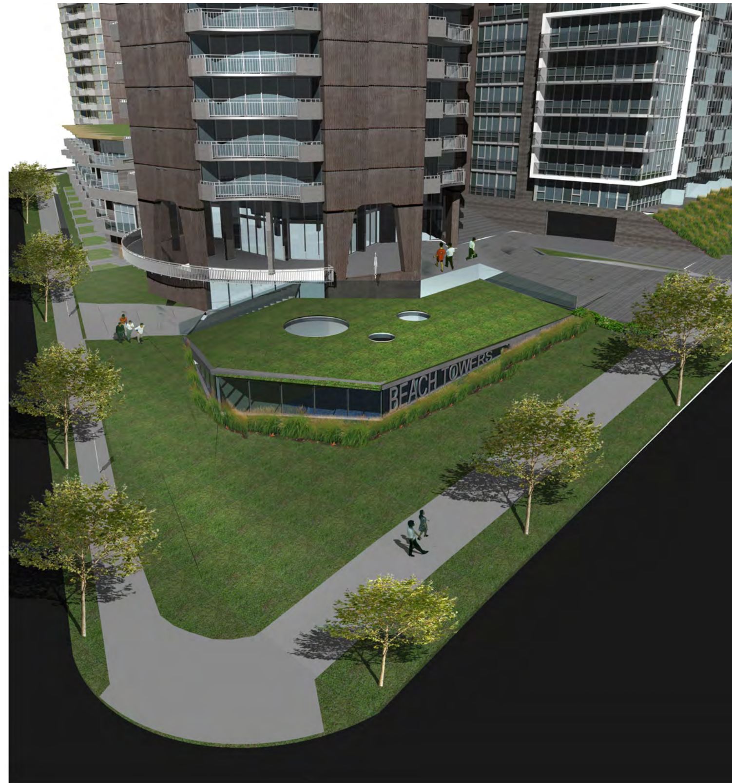
PROPOSED AMENITY PAVILION