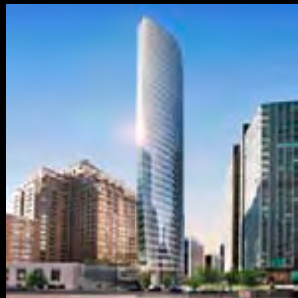
UNIVERSITY CLUB, VANCOUVER, CA