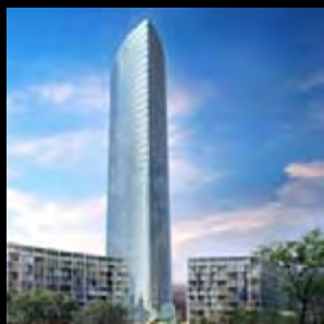
IBERDROLA, BILBAO, ES