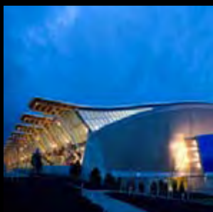
OLYMPIC OVAL, RICHMOND, CA