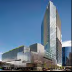
FAIRMONT PAC. RIM, VANCOUVER, CA