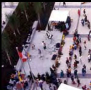
CITY HALL, RICHMOND, CA