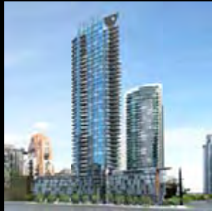
THE MARK, VANCOUVER, CA