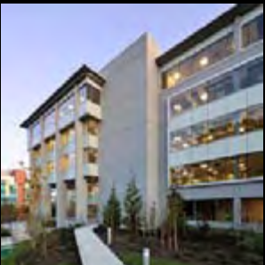
DISCOVERY GREEN, VANCOUVER, CA

DIALOG ARCHITECTURE. VANCOUVER, BC, CANADA