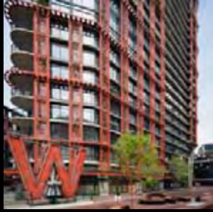
WOODWARD'S, VANCOUVER, CA