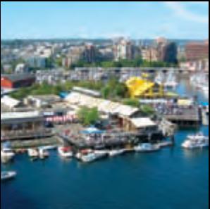
GRANVILLE ISLAND, VANCOUVER, CA

BJARKE INGELS GROUP ARCHITECTURE. COPENHAGEN, DENMARK