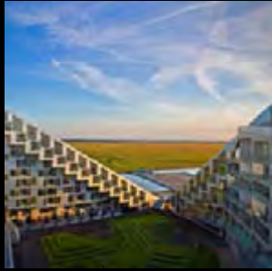
8 HOUSE, COPENHAGEN, DK