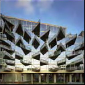
VM HOUSES, COPENHAGEN, DK

WESTBANK PROJECTS CORP. REAL STATE DEVELOPER. VANCOUVER, BC, CANADA