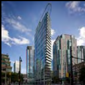
FLATIRON, VANCOUVER, CA