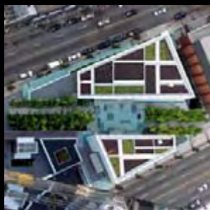
SHANGRI-LA, VANCOUVER, CA