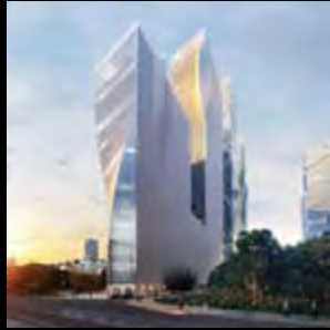
SEM, SHENZHEN, CN