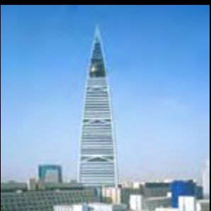
AL FAISALIAH, RIYADH, SA

PFS URBAN / LANDSCAPE DESIGN. VANCOUVER, BC, CANADA