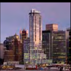
SHAW TOWER, VANCOUVER, CA

GLOTMAN SIMPSON CONSULTING ENGINEERS. VANCOUVER, BC, CANADA