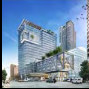
CORNER TELUS DAY, VANCOUVER, CA