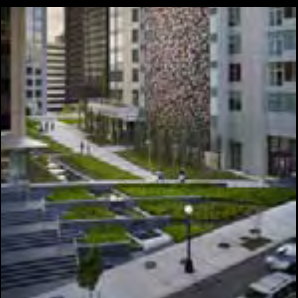
5TH & MADISON, VANCOUVER, CA

COBALT ENGINEERING LLP SUSTAINABLE DESIGN. VANCOUVER, BC, CANADA