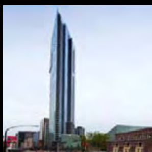
SHANGRI-LA, VANCOUVER, CA