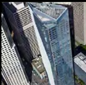
MILLENNIUM, SAN FRANCISCO, US