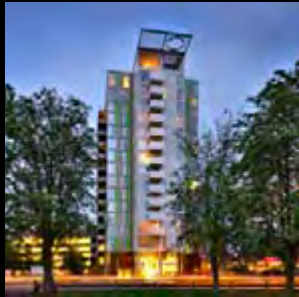
CENTRO, VANCOUVER, CA