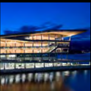
CONVENTION CENTRE, VANCOUVER, CA

BURO HAPPOLD CONSULTING ENGINEERS. NEW YORK, NY, USA