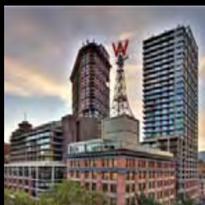
WOODWARDS, VANCOUVER, CA