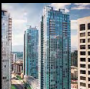
RES. ON GEORGIA, VANCOUVER, CA