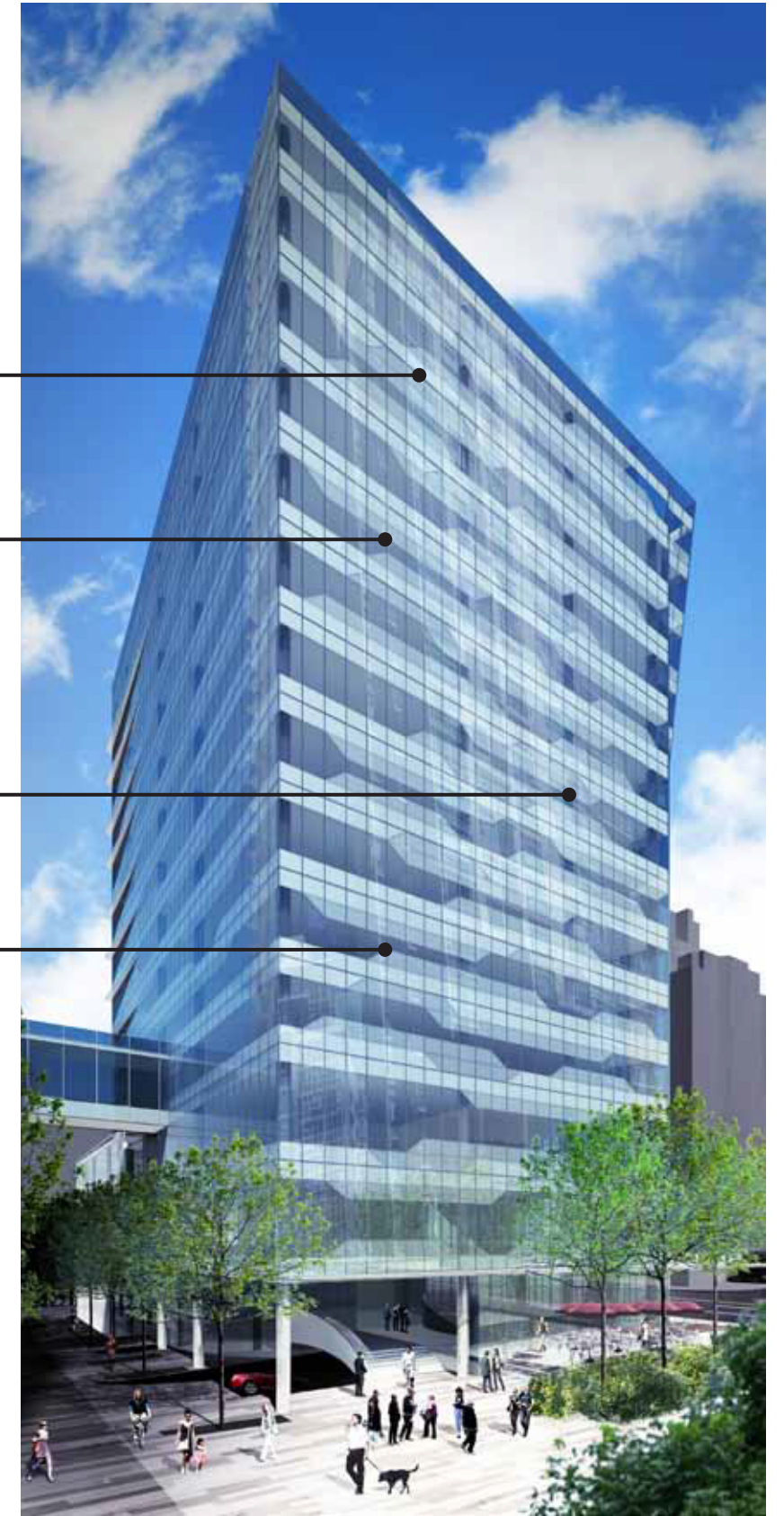
North East View