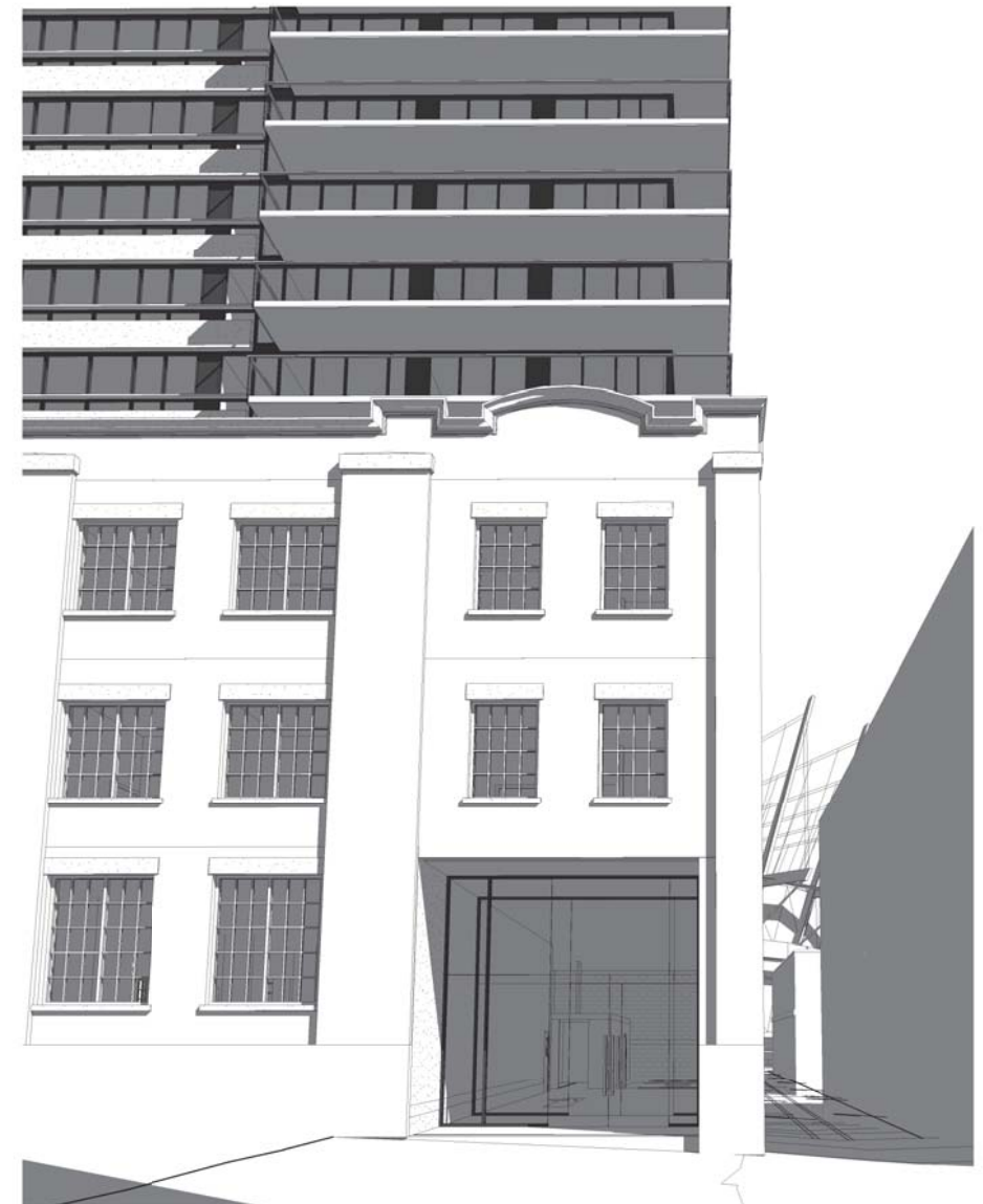
3D View 3