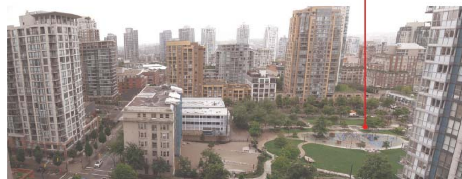
SOUTHEAST AERIAL VIEW FROM SITE