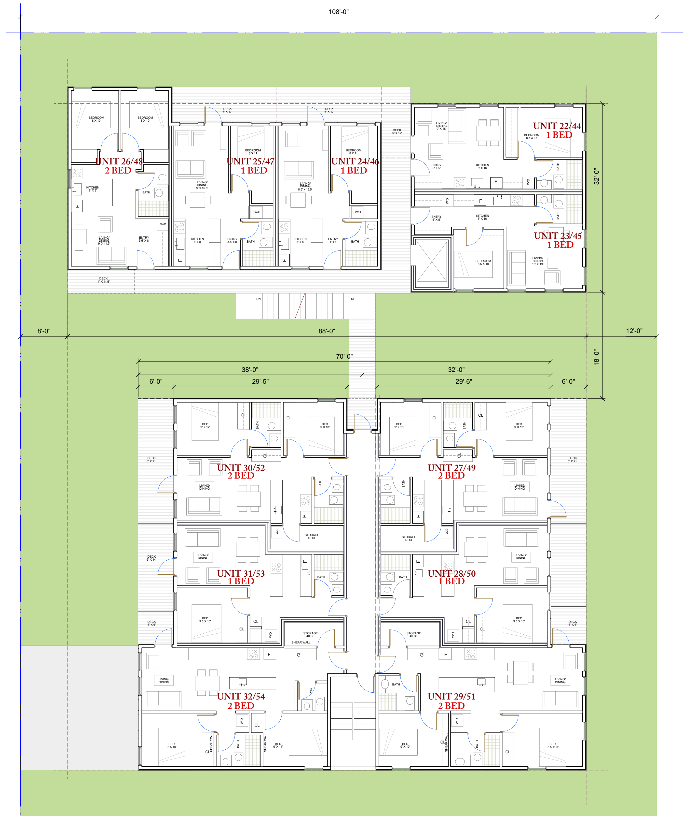
1 THIRD & FIFTH FLOOR PLAN 1/8" = 1'-0"