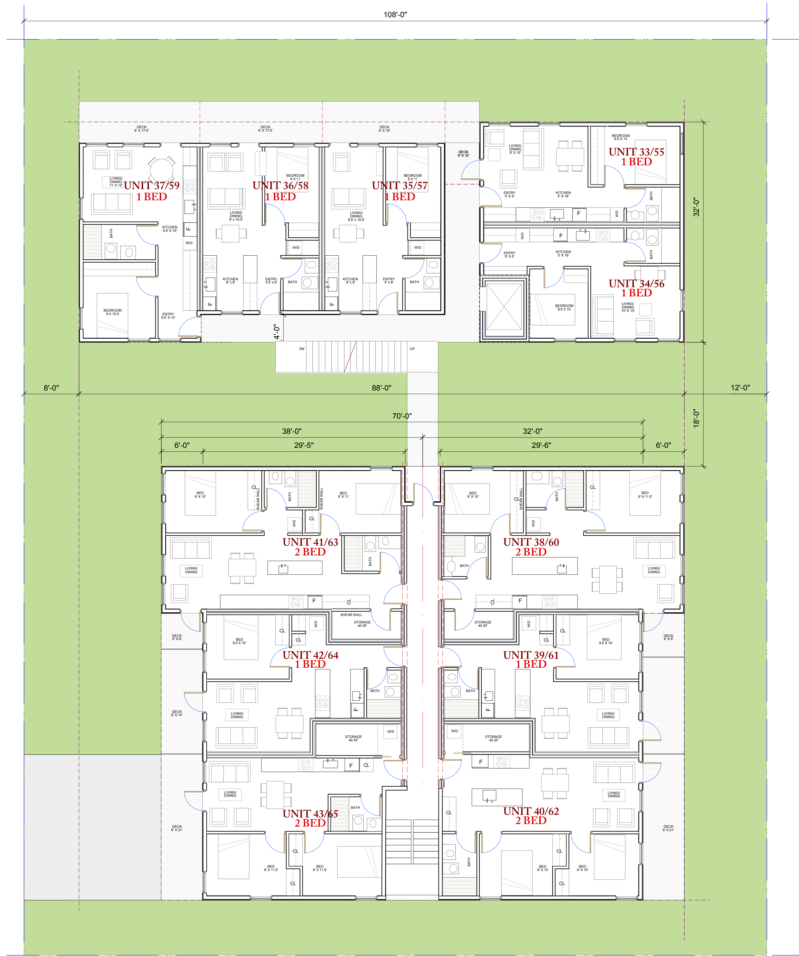
1 FOURTH & SIXTH FLOOR PLAN 1/8" = 1'-0"