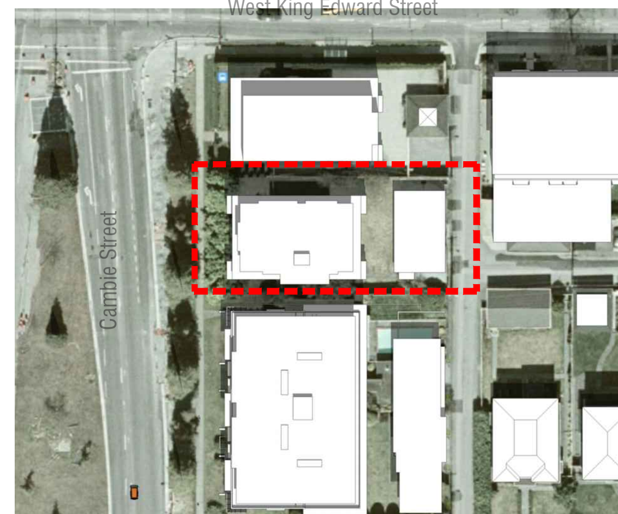
June 21, 12 PM