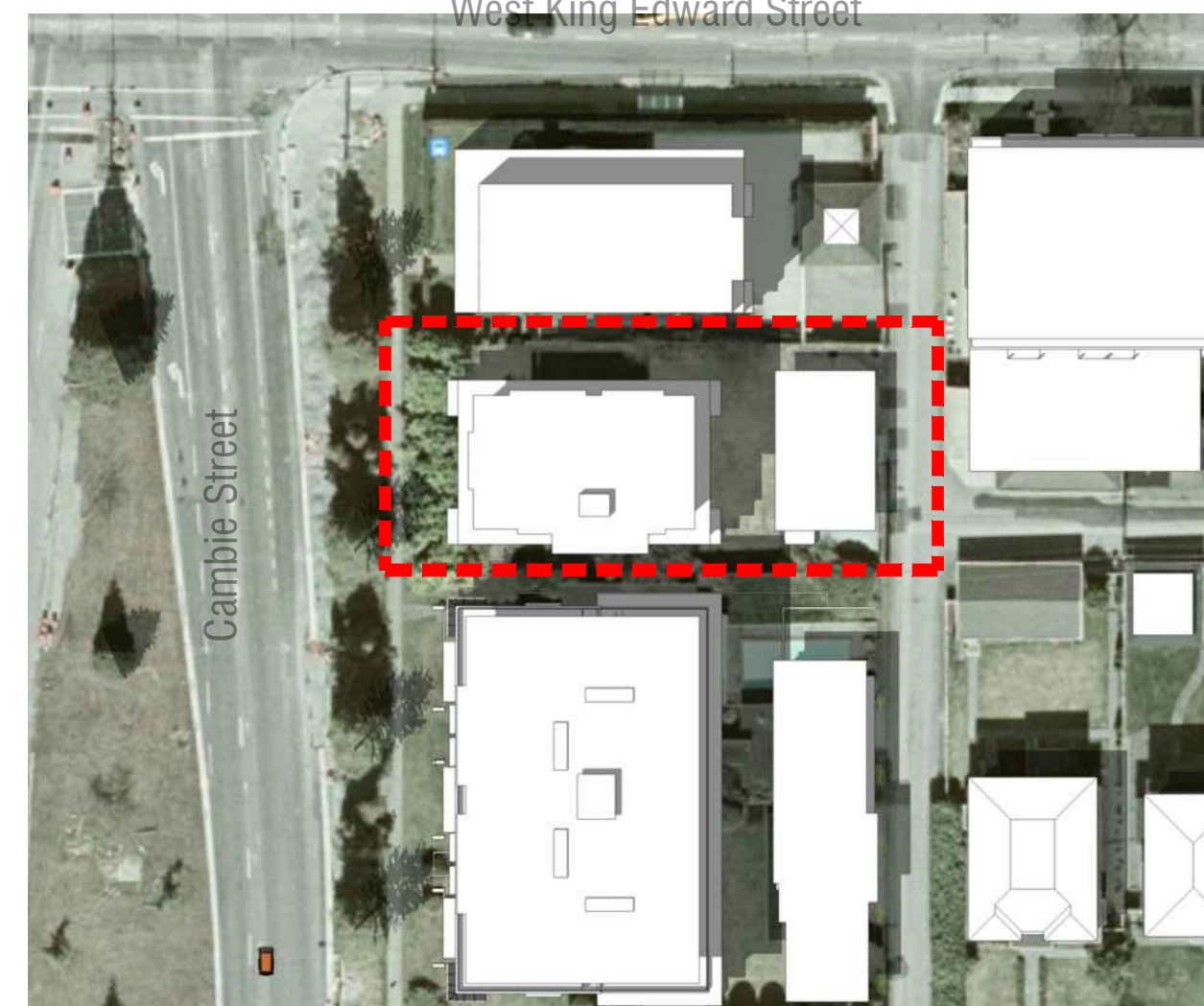
June 21, 2 PM