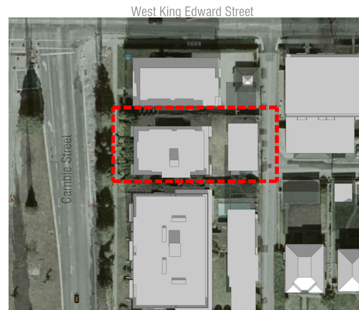
December 21, 12 PM