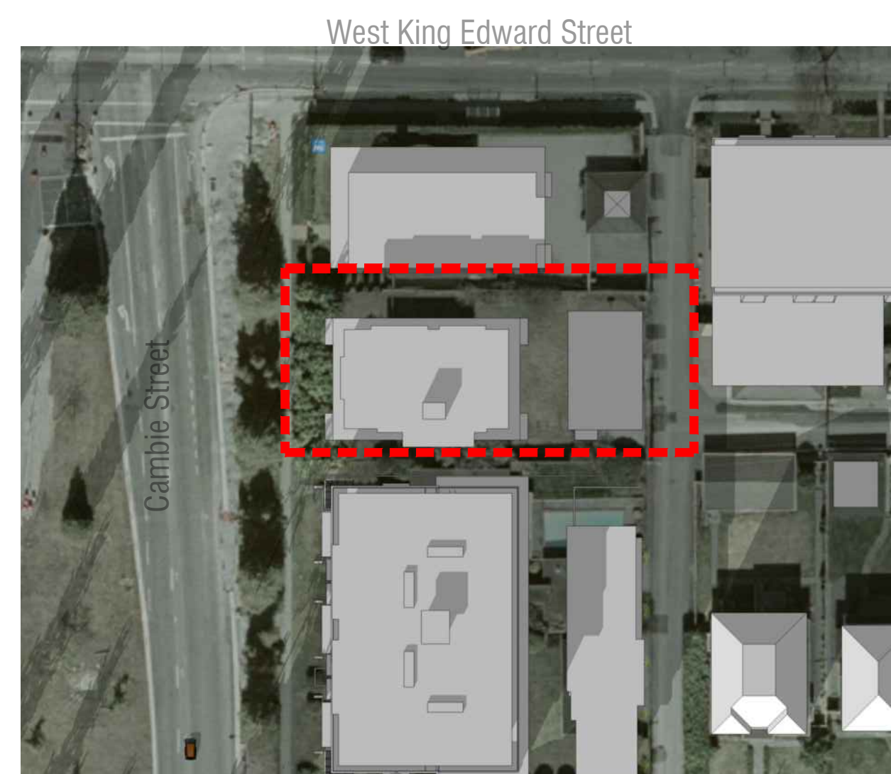
December 21, 2 PM