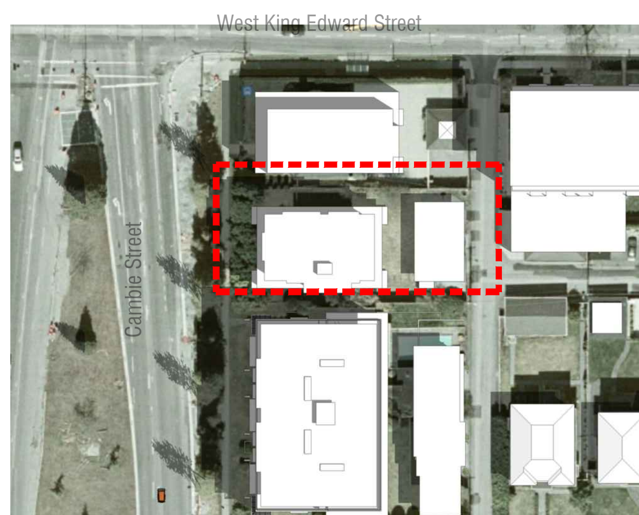
June 21, 10 AM