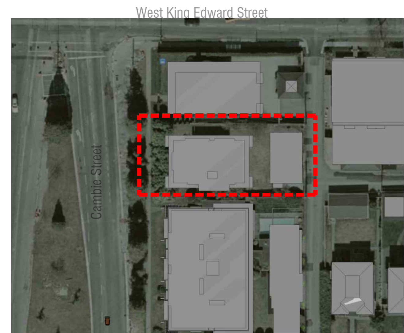
December 21, 4 PM