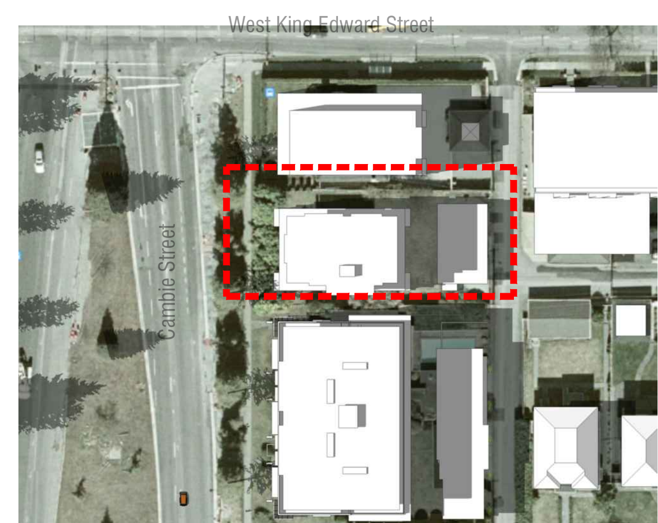
June 21, 4 PM