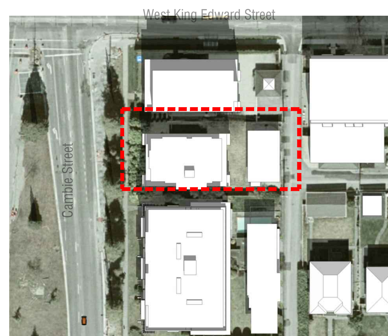
March 21, 12 PM