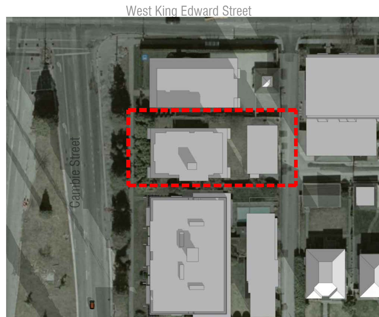
December 21, 10 AM