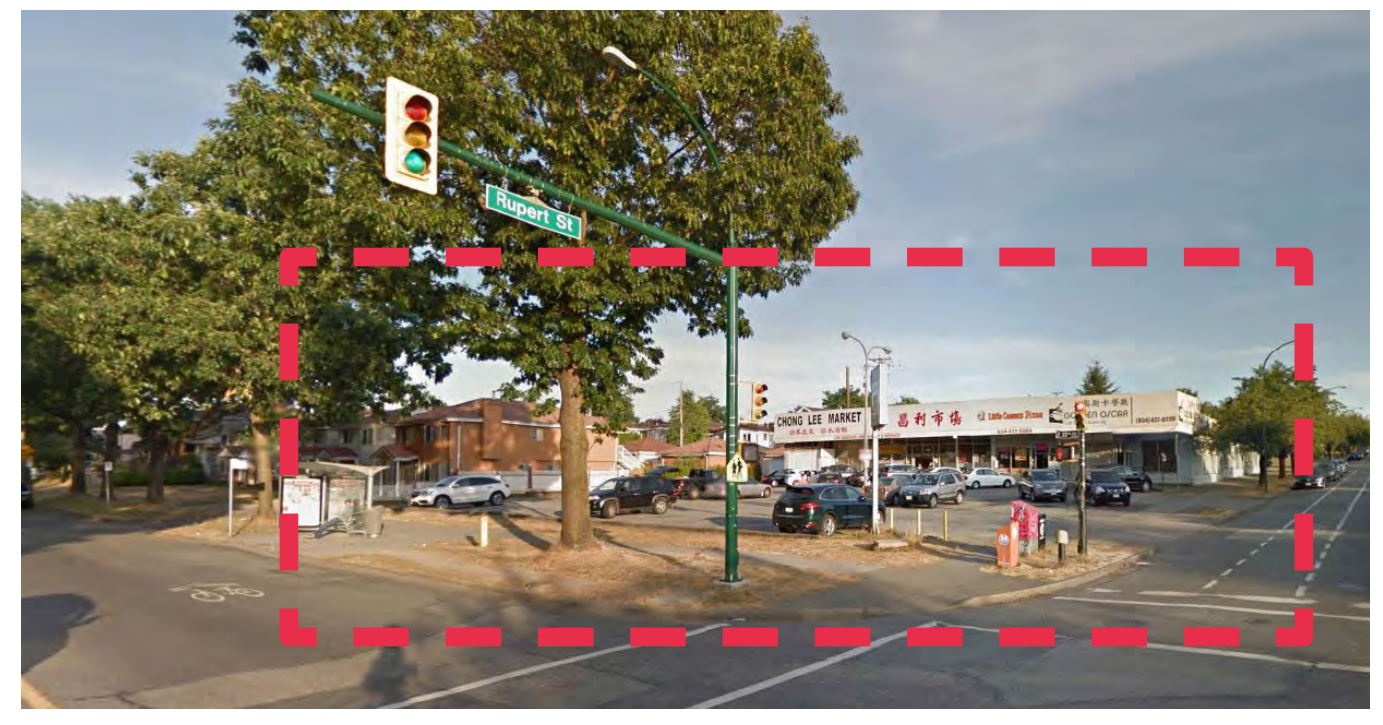
1 CORNER OF RUPERT AND 22ND AVENUE