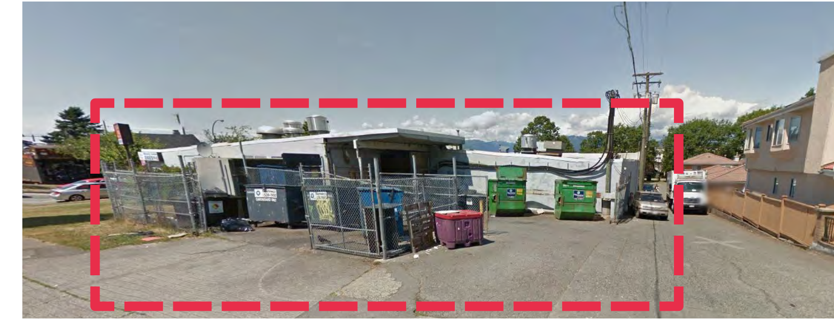
4 STREET FRONTAGE ON 23RD AVENUE