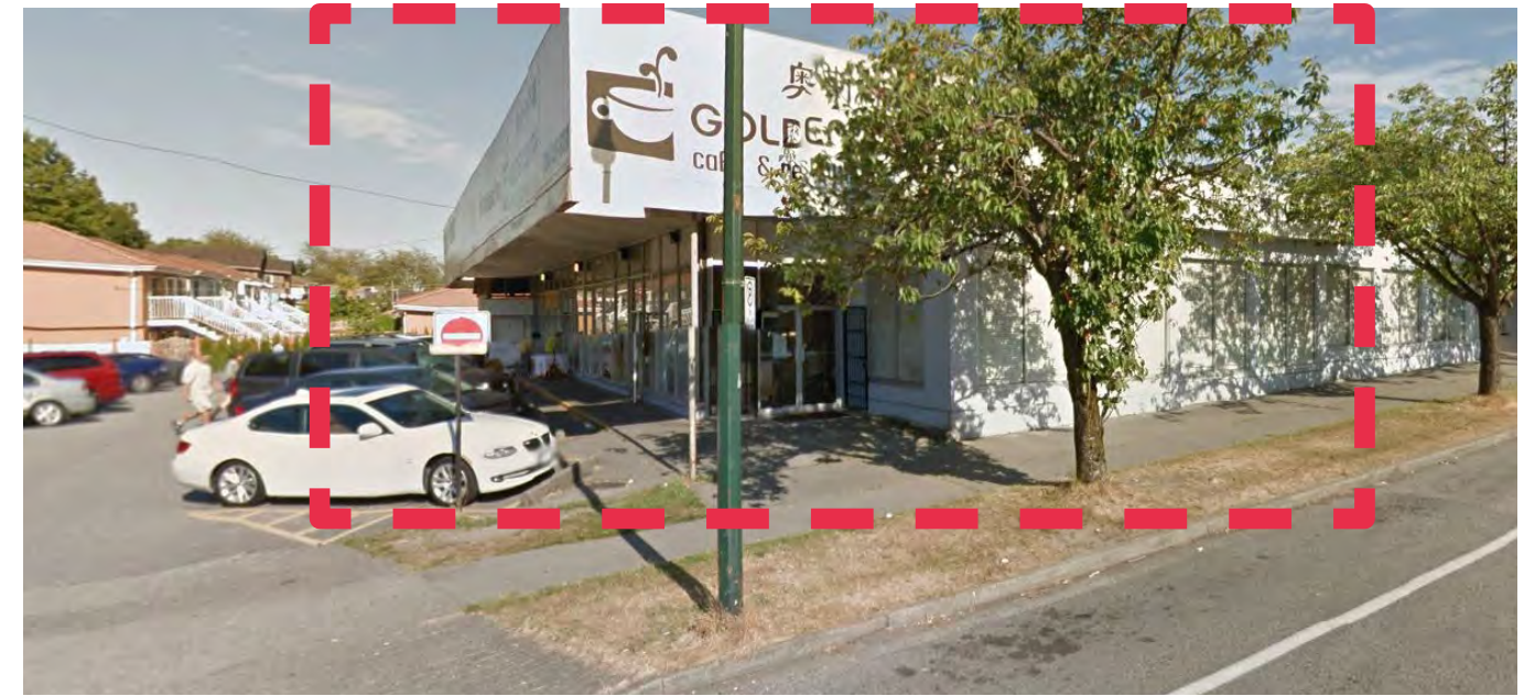
3 STREET FRONTAGE ON RUPERT STREET