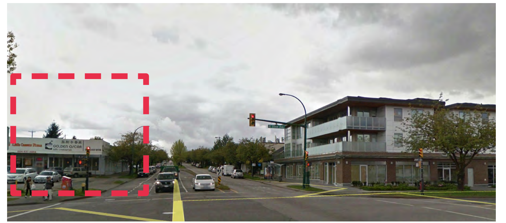
2 VIEW SOUTH UP RUPERT STREET